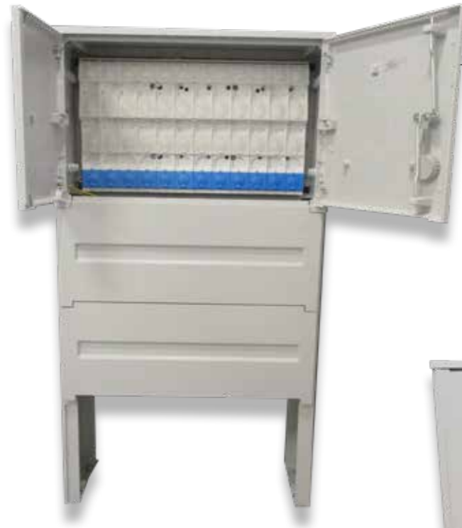
600 cabinet: 12 connection terminals